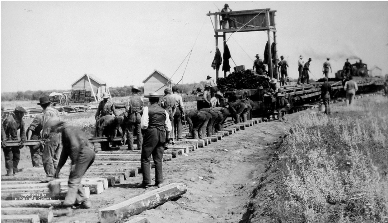
Early method of laying track Canadian Pacific Railway