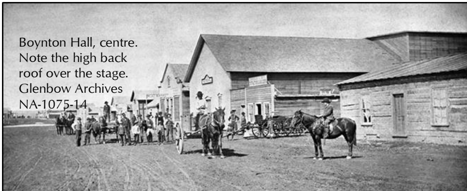
Boynton Hall, centre. Note the high back roof over the stage. Glenbow Archives NA-1075-14

The Weekly Herald described the Hall as "a substantial frame building, 94 x 36 feet. The auditorium is 57 x 36 feet, with a gallery over the entrance, and is calculated to seat 500 people. The stage is 37 feet deep, and is fitted up... [to shift] scenery ... from above, with... pulley and balance weights, like a window sash, a great improvement on the old-fashioned rollers." In praise of Boynton, the Herald wrote, "To men of enterprise like Capt. Boynton the town owes very much of her progress and such opportunities as the present should be embraced to show our appreciation of their efforts."