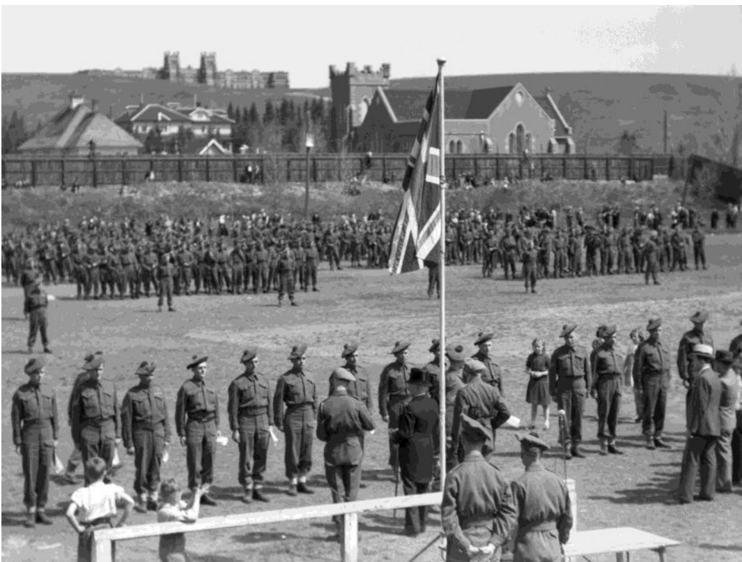
The Hillhurst Athletic Park ca. 1940